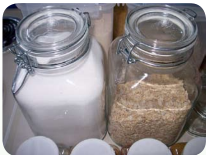
Keep food in sealed containers