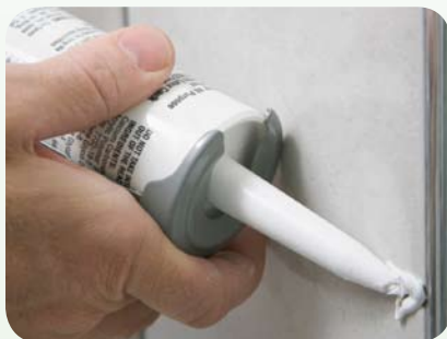
Caulk gaps and holes to keep pests out