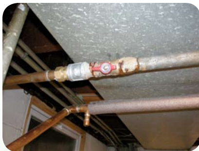
Repair leaky pipes and other water sources