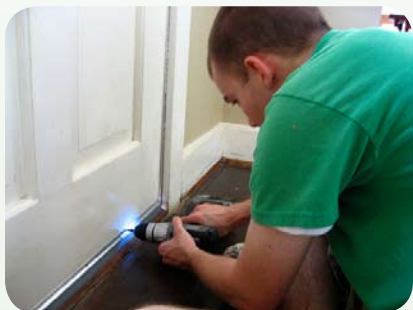
Install weather-stripping to eliminate spaces